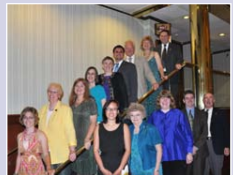
The National Council of Alpha Lambda Delta at the 2009 National Council meeting in St. Louis, MO. In 2010, the Council will be meeting in historic Savannah, GA.

Interested? To apply, prepare a vita and a letter of interest and mail both to the National Office by May 15!